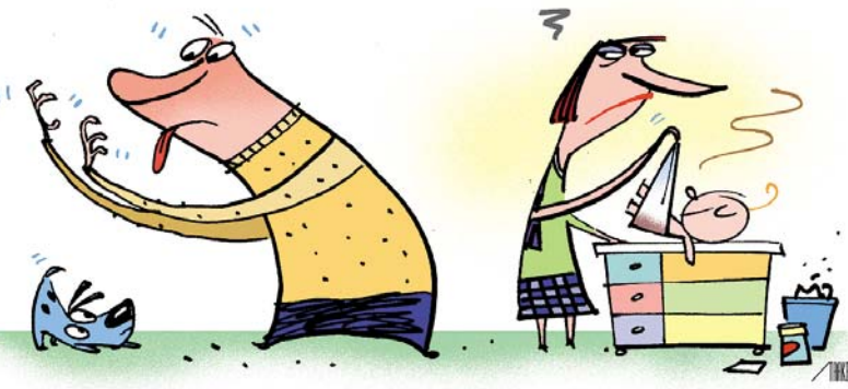
BY BOB STAAKE FOR THE WASHINGTON POST

malefactual: What your husband becomes when it's his turn to change the baby efflamatory: describing incendiary blogging trafle: a dessert that's not kosher